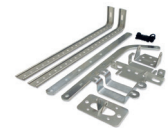
AC-470 Support bracket kit